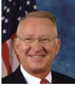
Congressman Buck McKeon